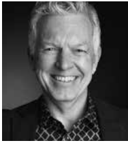
ULBE JELLUMA MD PRINT POWER

Print Power wants to bring the knowledge of advertising effectiveness in the publishing, printing and paper industries closer to the advertisers, media and creative agencies in order to stimulate the use of advertising in printed media.